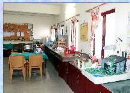
Community Health Lab