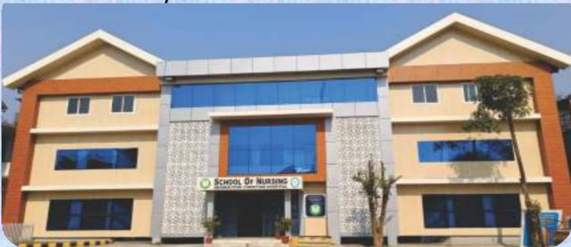
Well Established College